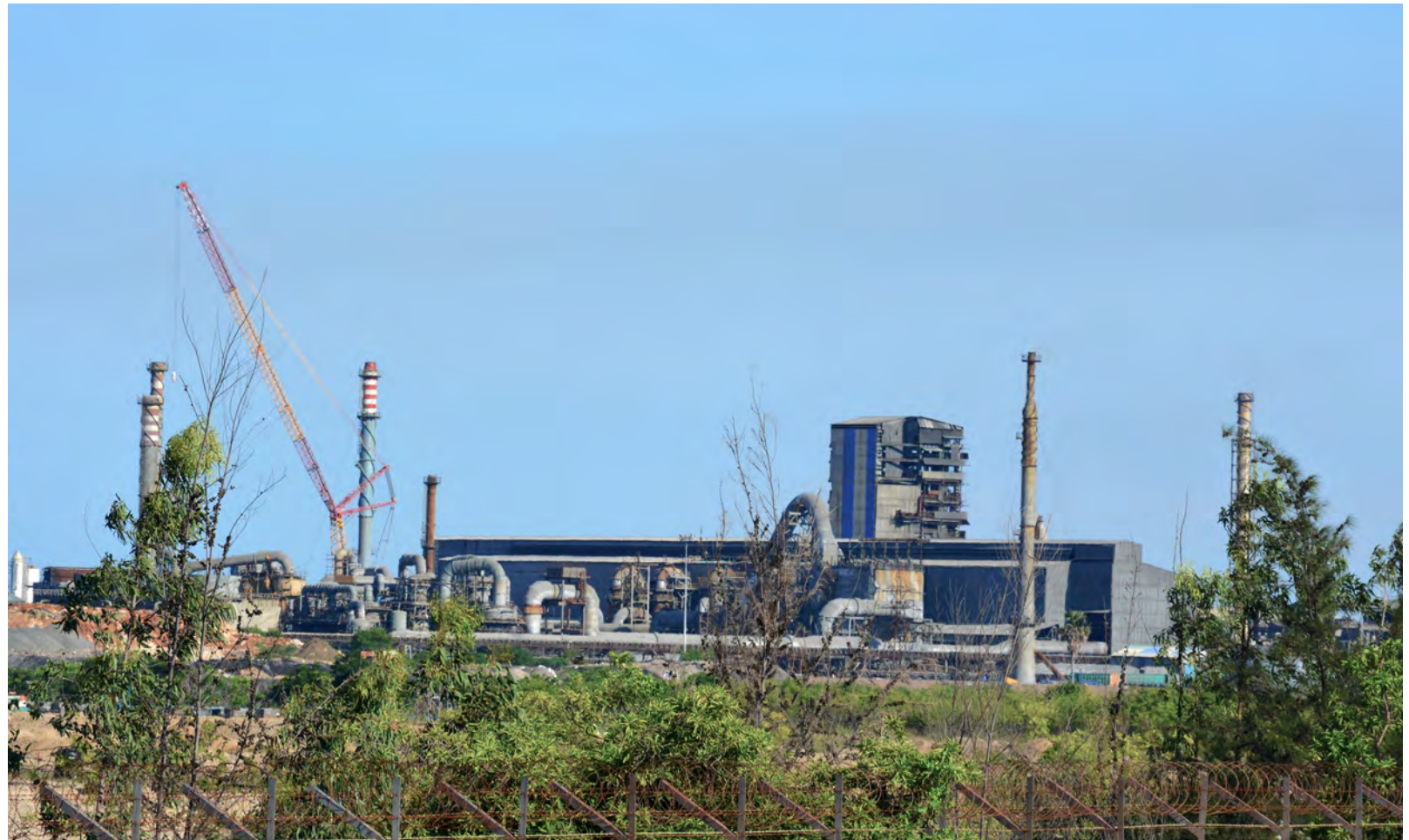
Sterlite Copper Smelting Plant, Thoothukudi, Tamil Nadu.

There is unequivocal evidence that immediately after May 22 in the aftermath of the rally police powers apparently unsupported by valid authority are being abused to conduct searches, make unjustified spot arrests, and hold people in custody in denial of their rights to be arrested for valid reason, be provided with representation and be brought before a judicial magistrate at the earliest. Widespread accusations of such repeated illegalities we believe amount to abuse of power and serious crimes under the IPC and amount to obstruction of justice as they prevent victims from accessing justice without fear or favour.